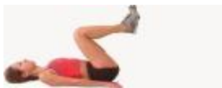
Knee-in for lower abs

EXERCISE: Flex your lower abs tightly and make sure you keep your knees together. Pull your knees in toward your chest until you meet discomfort. Return to starting position while keeping your abs flexed. For an added strengthening benefit, use a dumbbell between your ankles.