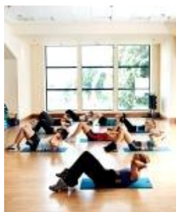
Crunch for upper abs

EXERCISE: Curl your body upward until your shoulders are off the ground. (Do not sit all the way up.) Flex your upper abdominal muscles the entire time, and as hard as possible. Return to your starting position while still flexing. Repeat until you finish your set of 15 reps. Continue with a lower abdominal muscle exercise set.